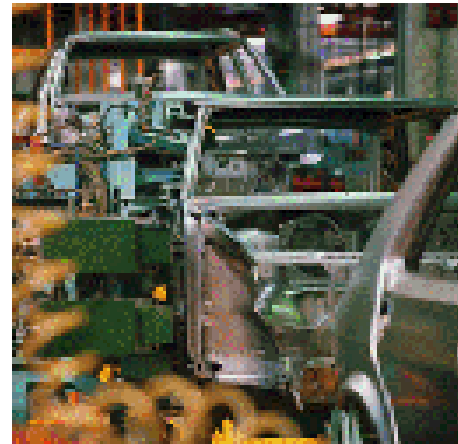
Safety Training can accommodate busy production schedules.