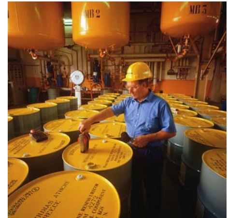
Facility safety audits can improve safety performance; reduce injury, cost and regulatory fines.